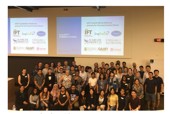
Summer School - Brisbane