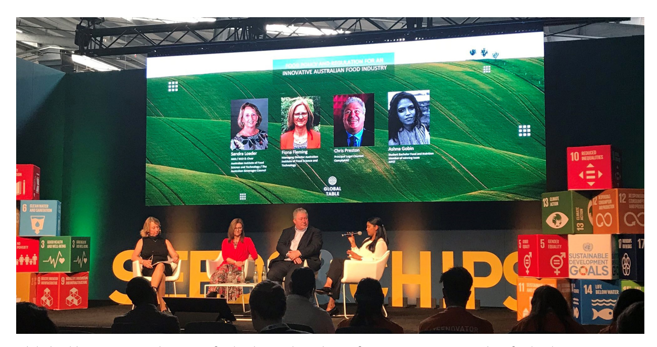
Global Table - AIFST panel session - food policy and regulation for an innovative Australian food industry.