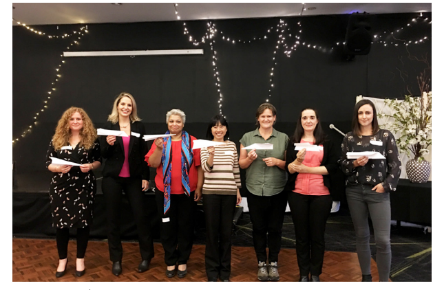
Trivia Night - Victoria