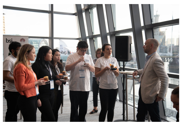
Young Professionals Breakfast