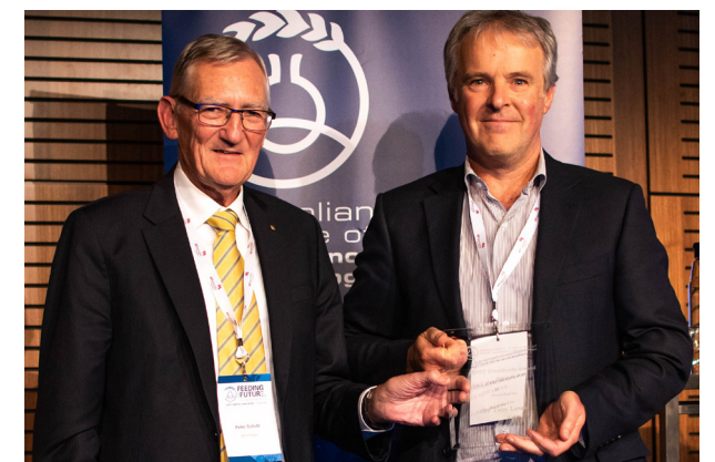
AIFST President's Award