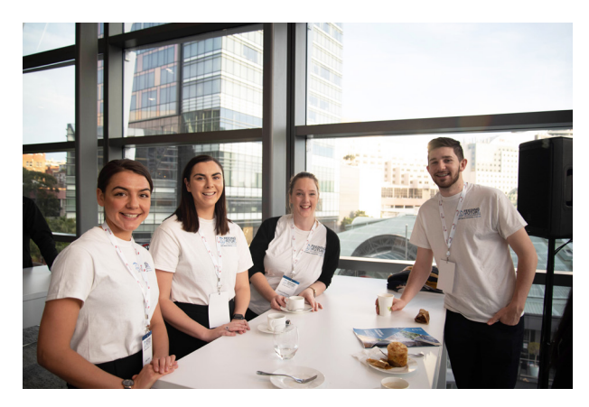
AIFST student member volunteers at the convention